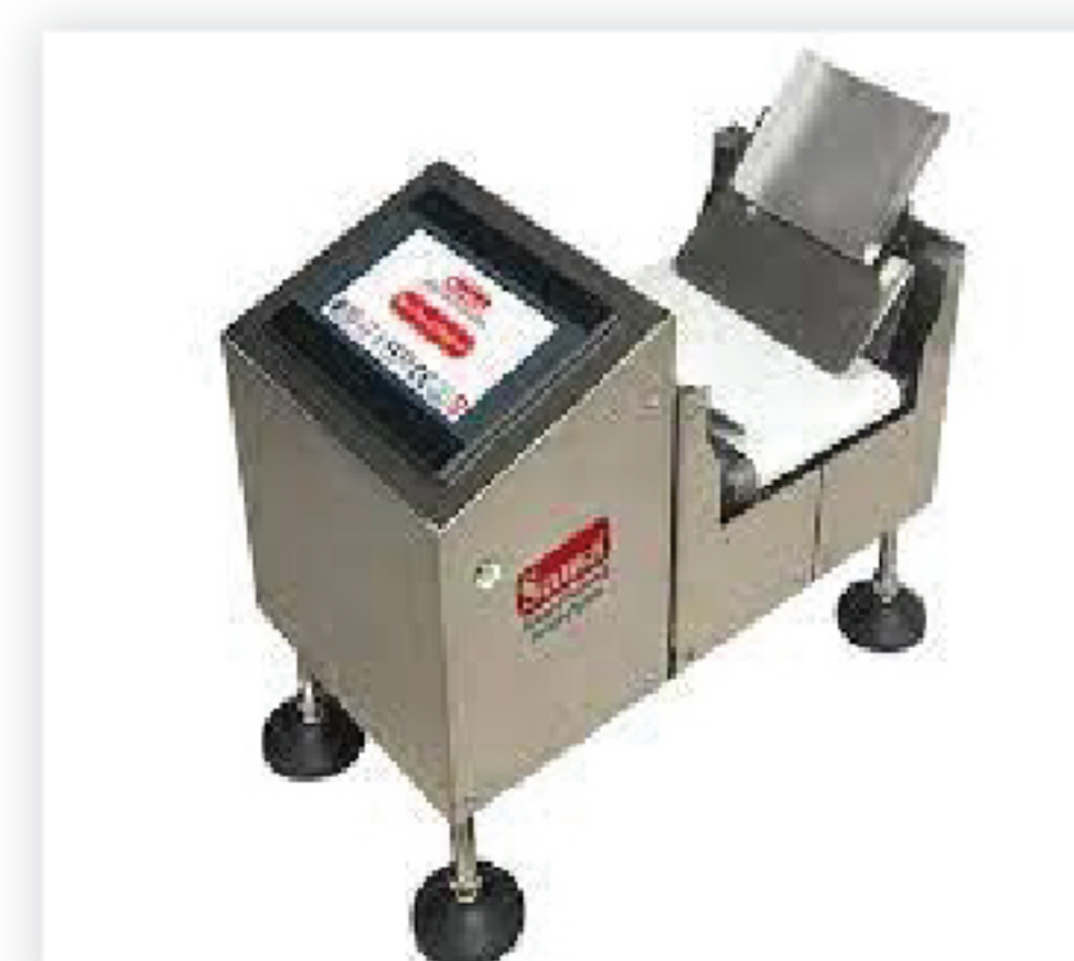
Mini Check Weigher